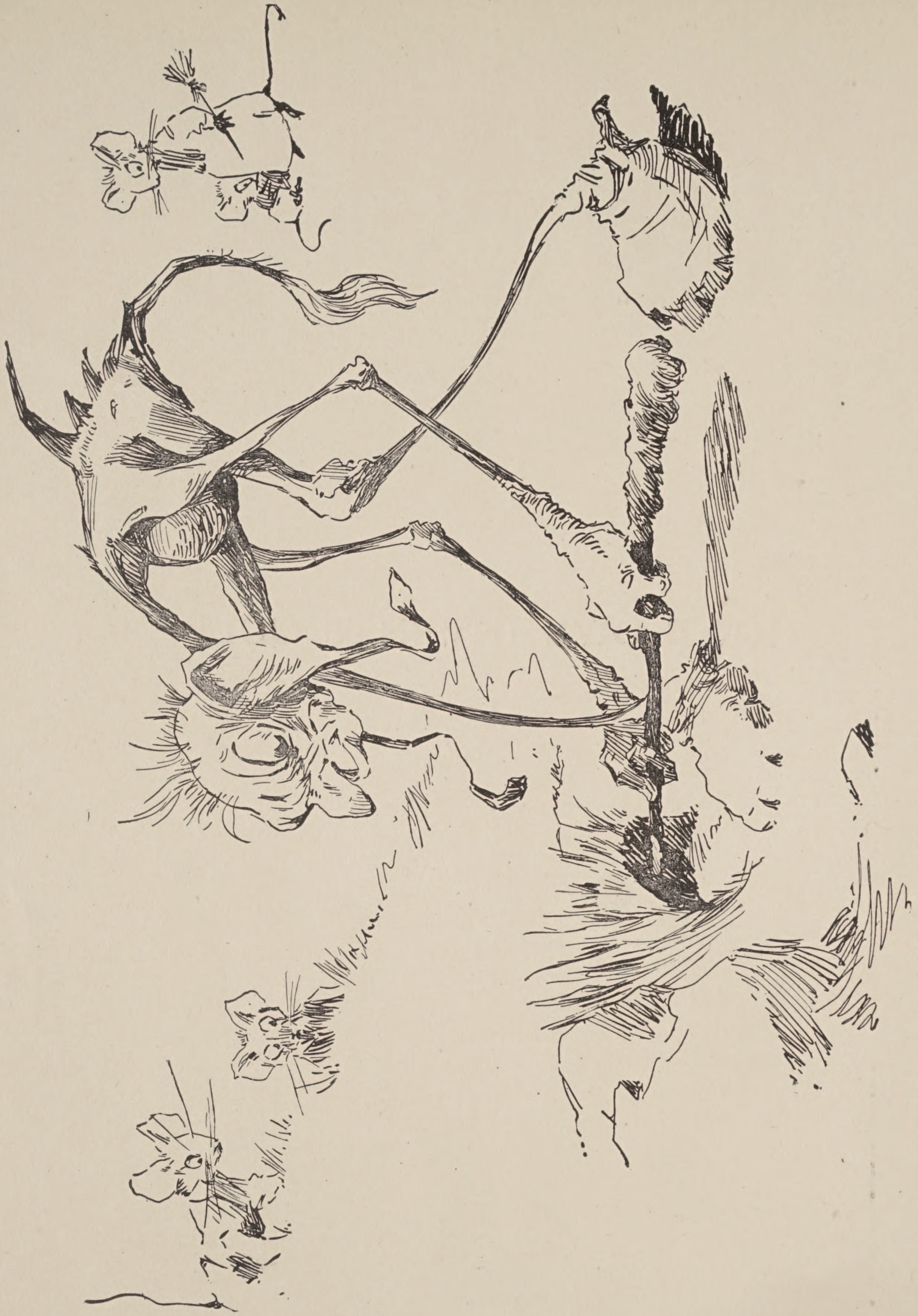
BOGEY MAN DISTURBS THE ANIMALS' HOUSES.